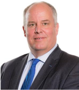
Committee Chair: Andrew RT Davies MS Welsh Conservatives